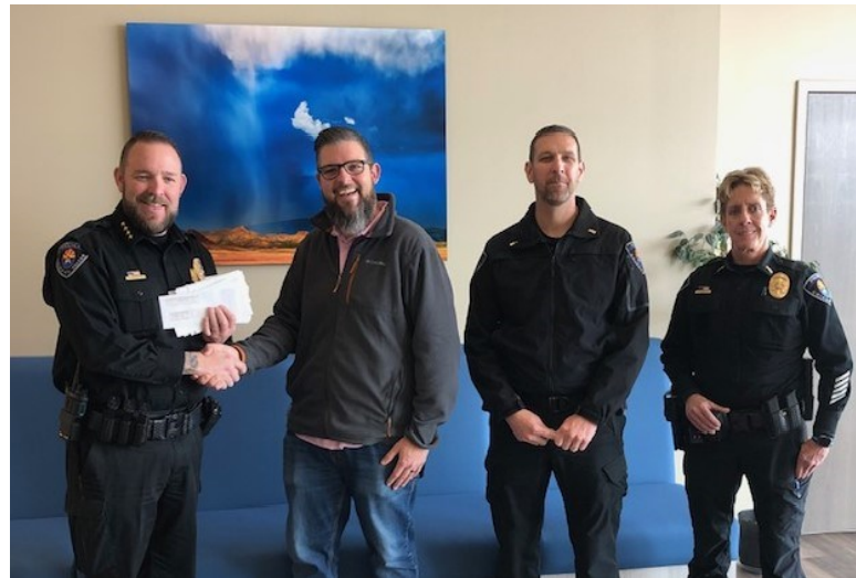
Chino Valley Police Department