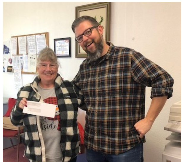
People Who Care