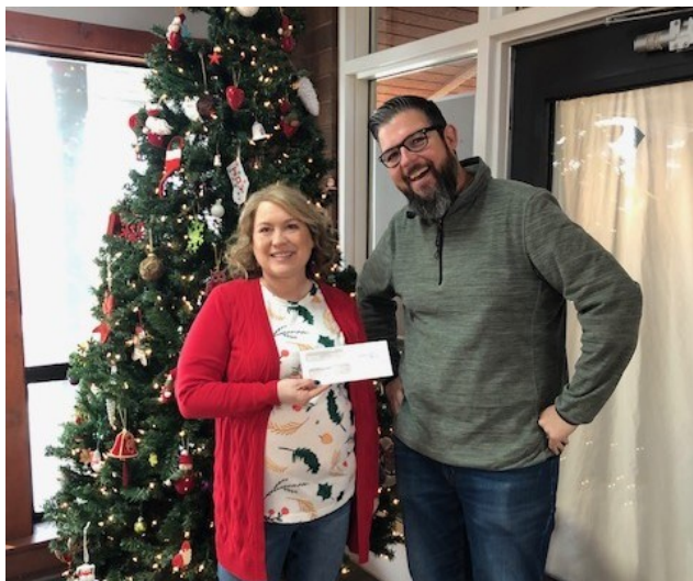
Chino Valley Meals on Wheels