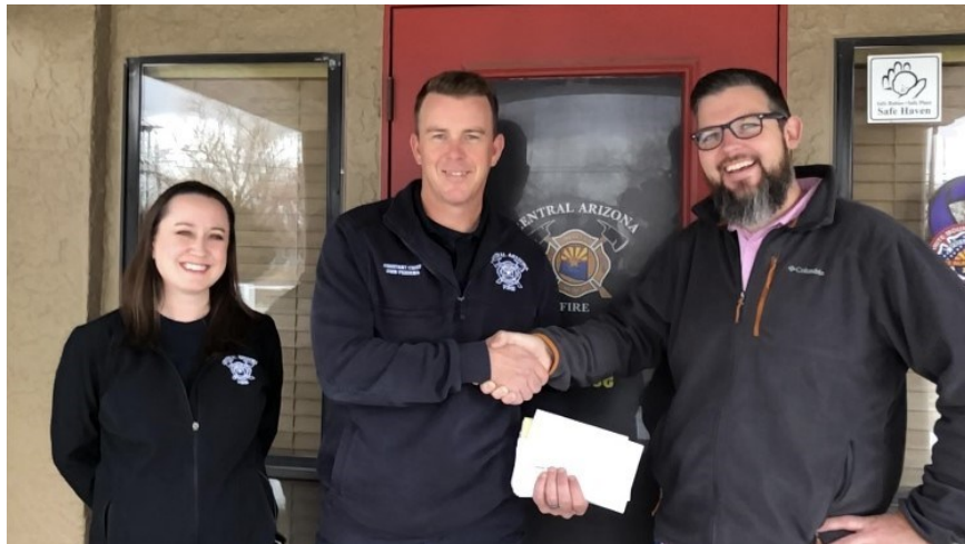
Chino Valley Fire Department