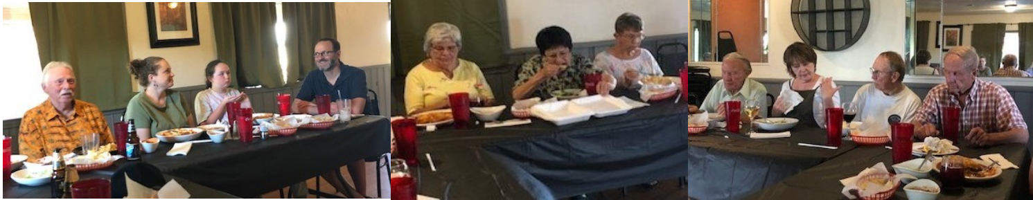
Appreciation Dinner Choir & Sound Booth Techs