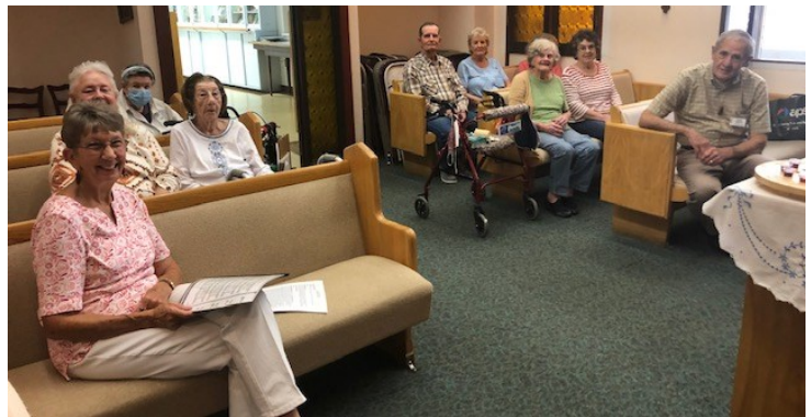
Arizona Pioneer Home Worship Service