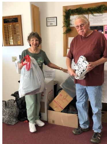
Helping Prescott Valley UMC collect shoes for underprivileged countries. A total of 200 pair were collected from our church!