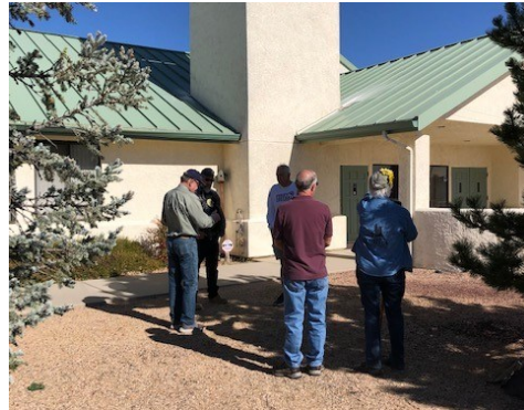
Planning for outside yard maintenance workday