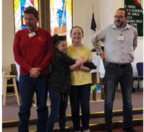
Friends forever ...